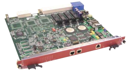
AdvancedTCA Base Switch Blade

Through a cohesive approach to embedded computing, Diversified Technology works hand-in-hand with your company to ensure that you are getting the best performance, the highest reliability, quickest time to market and the most efficient use of hardware for your embedded application.